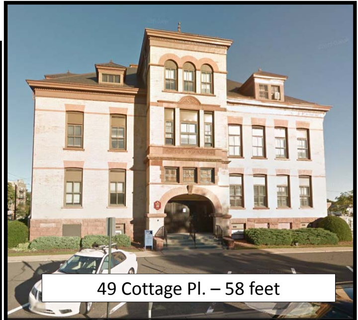
49 Cottage Pl. – 58 feet