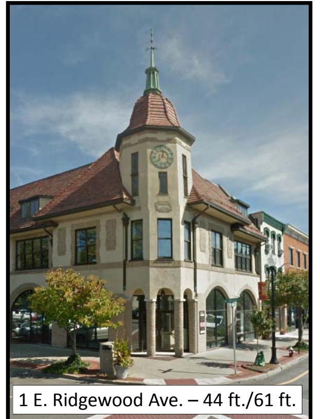
1 E. Ridgewood Ave. – 44 ft./61 ft.