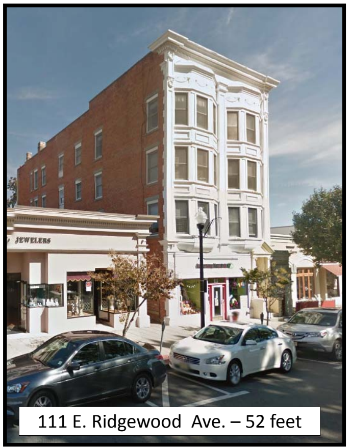
111 E. Ridgewood Ave. – 52 feet