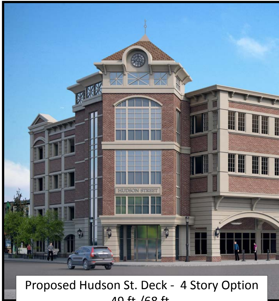
Proposed Hudson St. Deck - 4 Story Option 49 ft./68 ft.