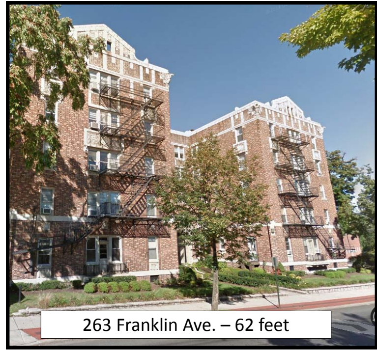
263 Franklin Ave. – 62 feet