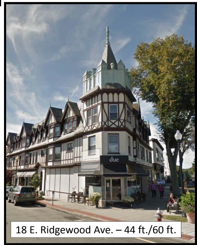
18 E. Ridgewood Ave. – 44 ft./60 ft.