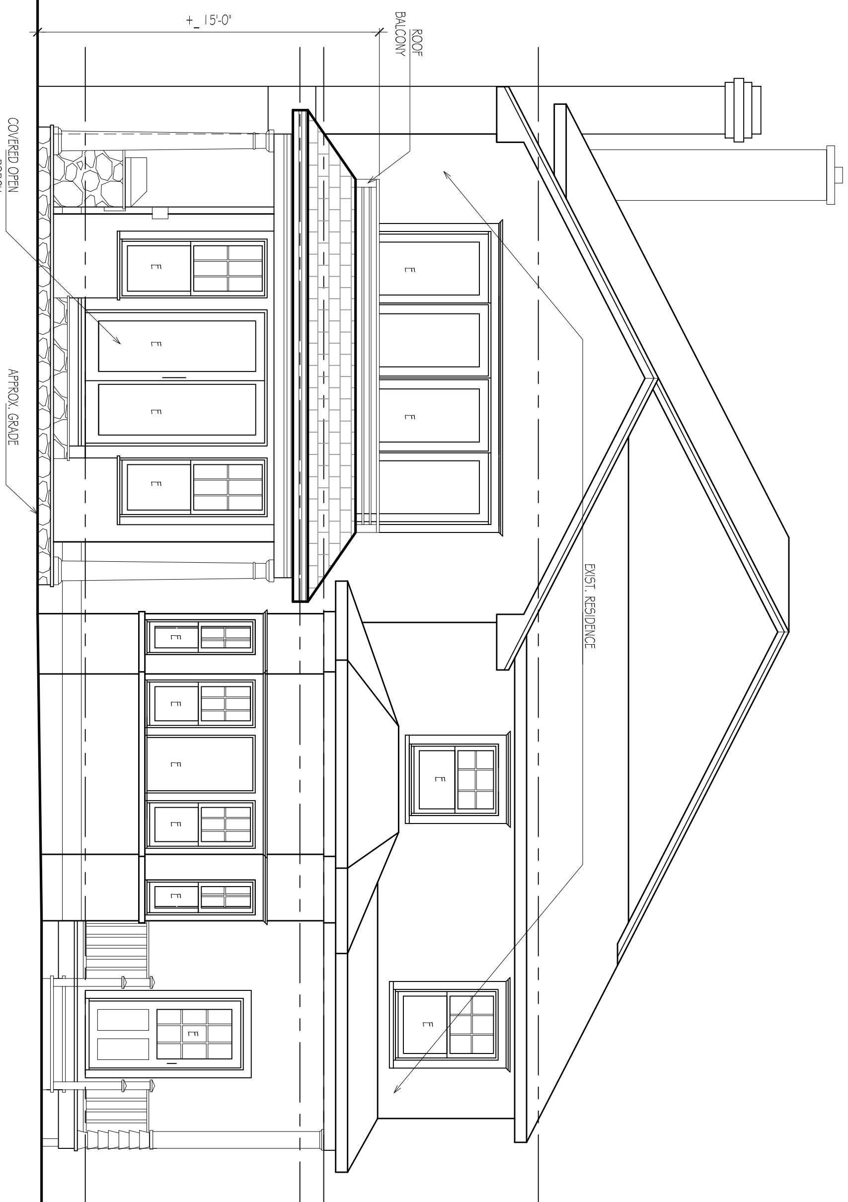
2 REAR ELEVATION SCALE: 1/4" = 1'-0"