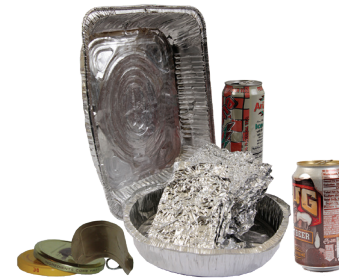
Metal Cans, Aluminum Foil, Small Metal Food Trays, Metal Lids (over 2")