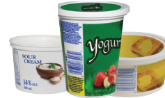
Plastic Dairy Tubs/Lids