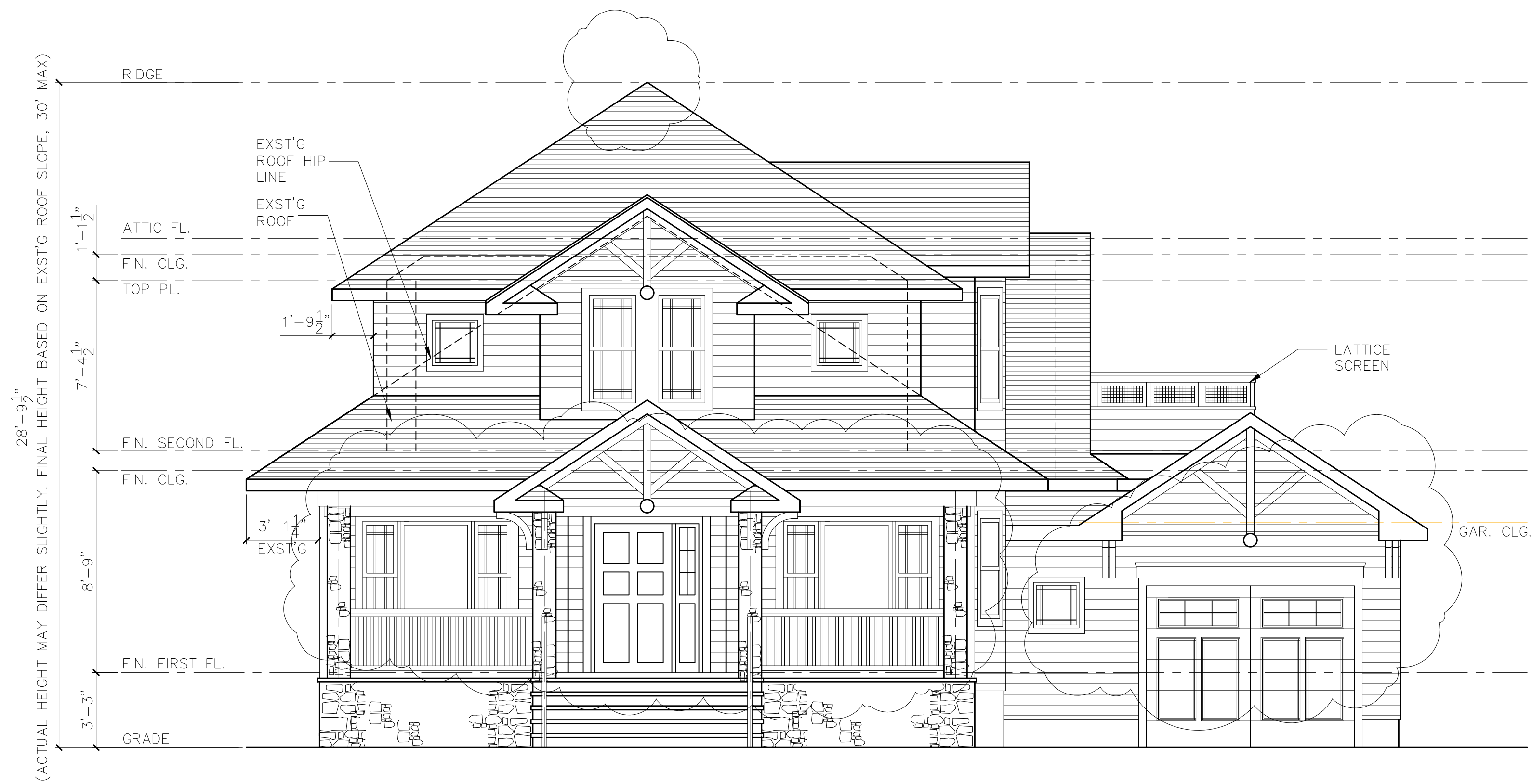
FRONT ELEVATION SCALE: 1/4"=1'-0"