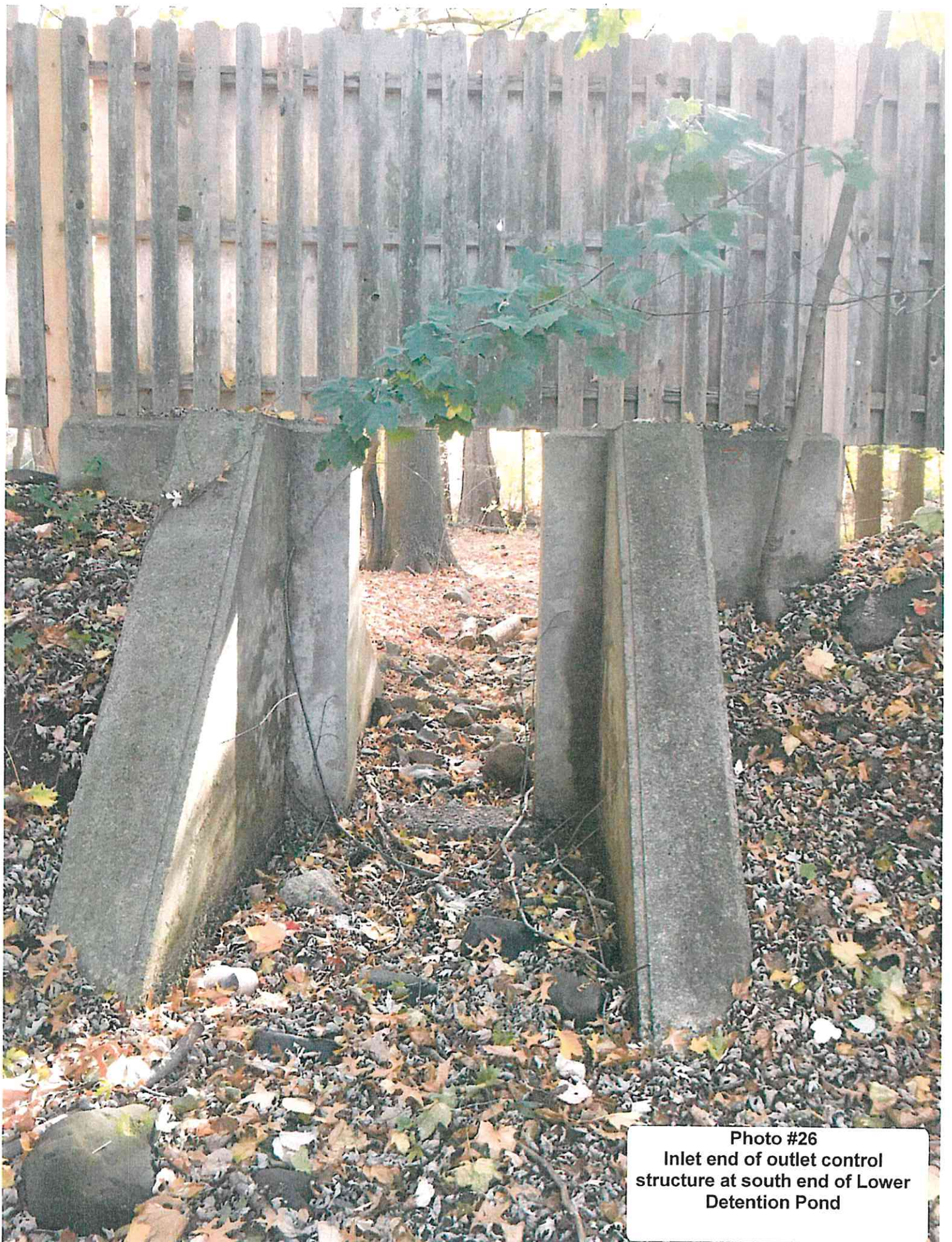
Photo #26 Inlet end of outlet control structure at south end of Lower Detention Pond