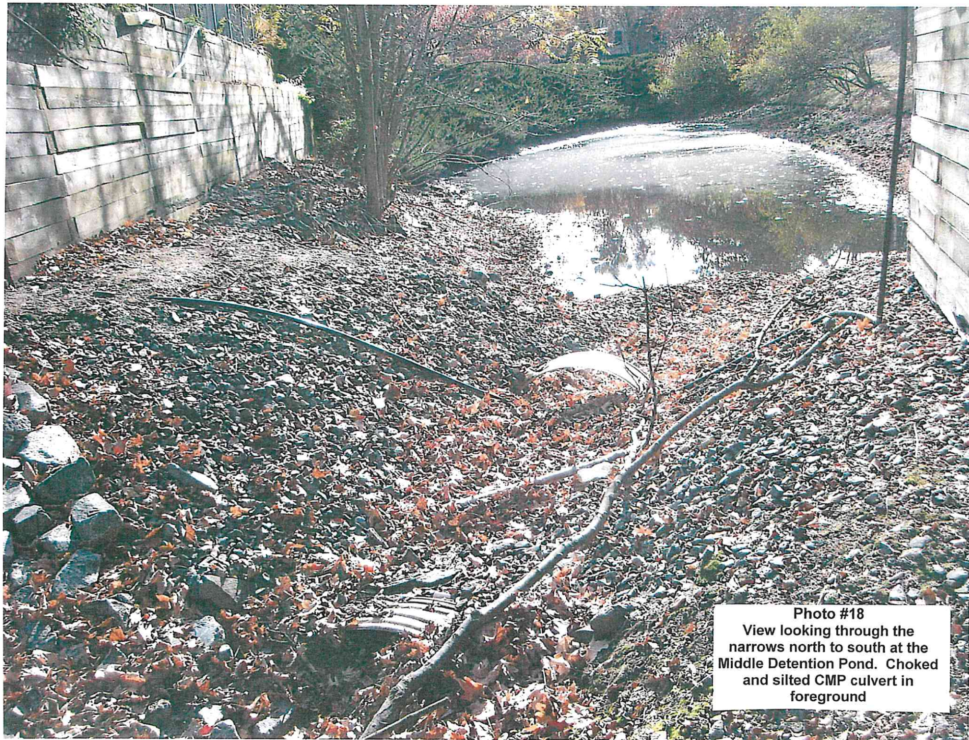
Photo #18 View looking through the narrows north to south at the Middle Detention Pond. Choked and silted CMP culvert in foreground