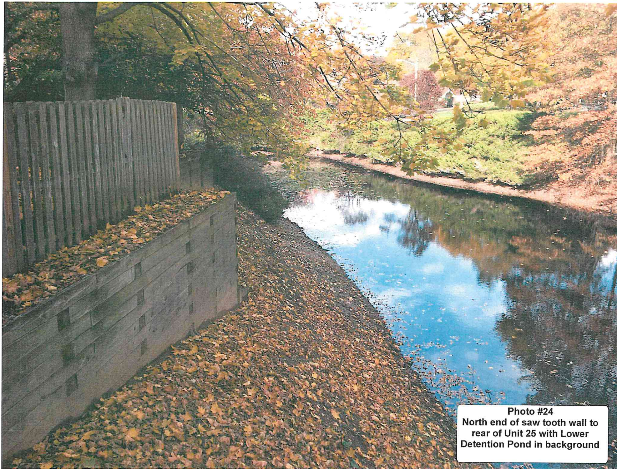
Photo #24 North end of saw tooth wall to rear of Unit 25 with Lower Detention Pond in background