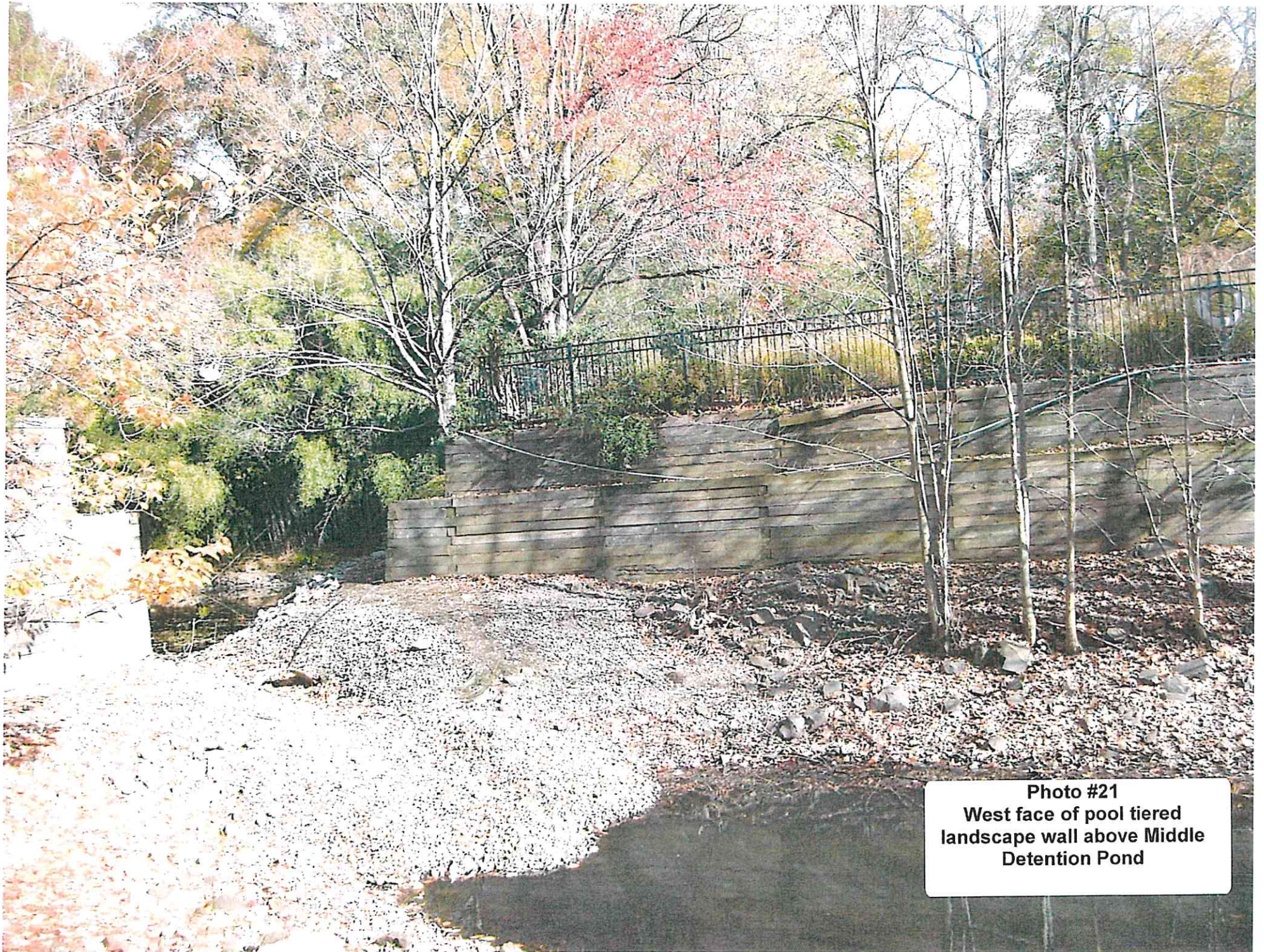
Photo #21 West face of pool tiered landscape wall above Middle Detention Pond