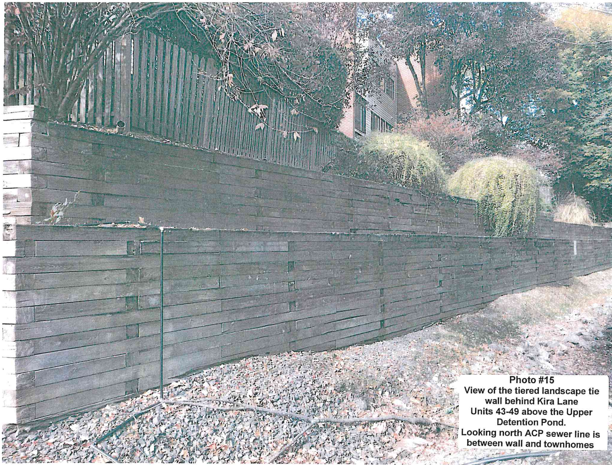
Photo #15 View of the tiered landscape tie wall behind Kira Lane Units 43-49 above the Upper Detention Pond. Looking north ACP sewer line is between wall and townhomes