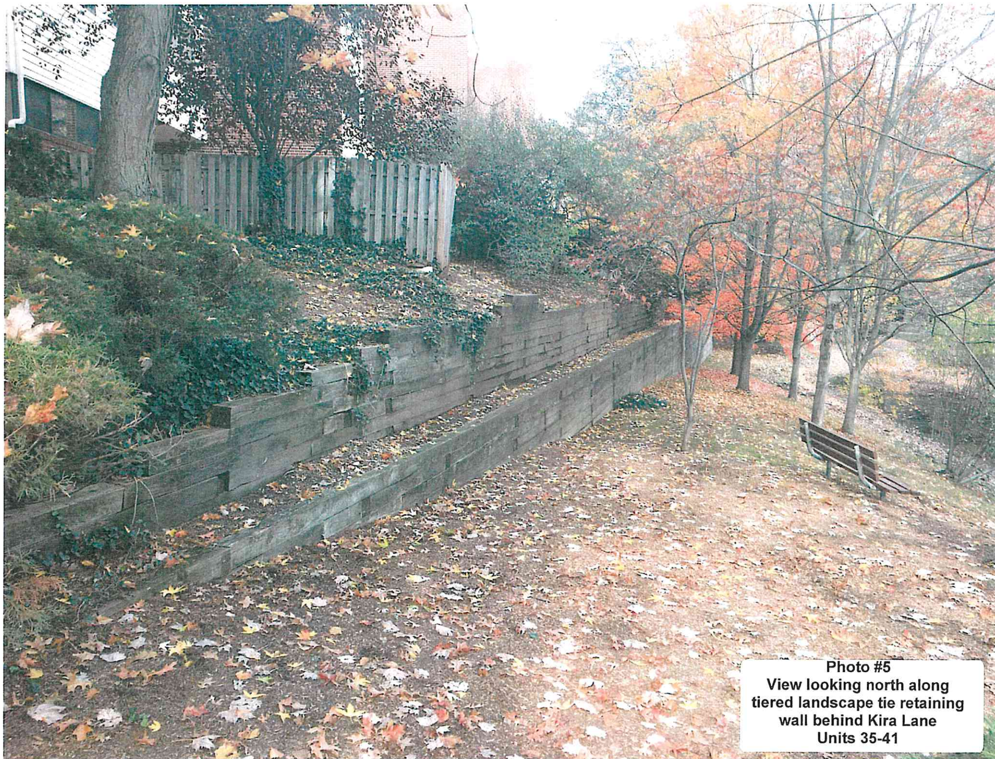
Photo #5 View looking north along tiered landscape tie retaining wall behind Kira Lane Units 35-41