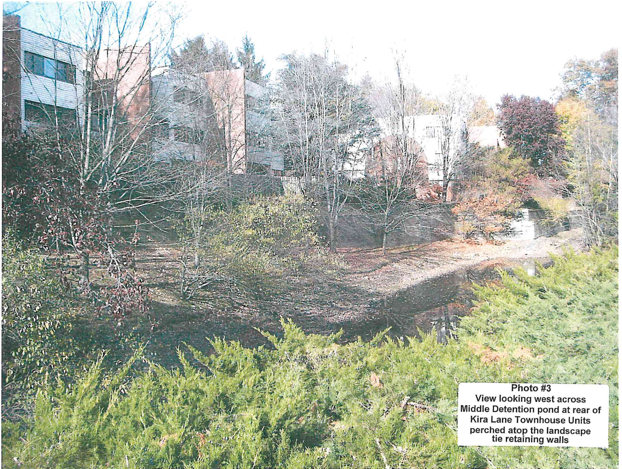
Photo #3 View looking west across Middle Detention pond at rear of Kira Lane Townhouse Units perched atop the landscape tie retaining walls