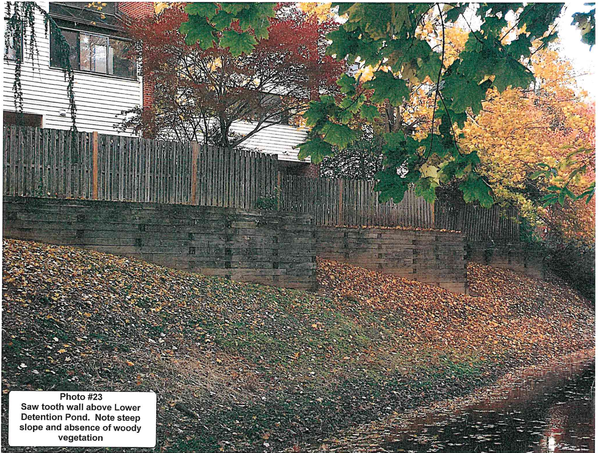
Photo #23 Saw tooth wall above Lower Detention Pond. Note steep slope and absence of woody vegetation