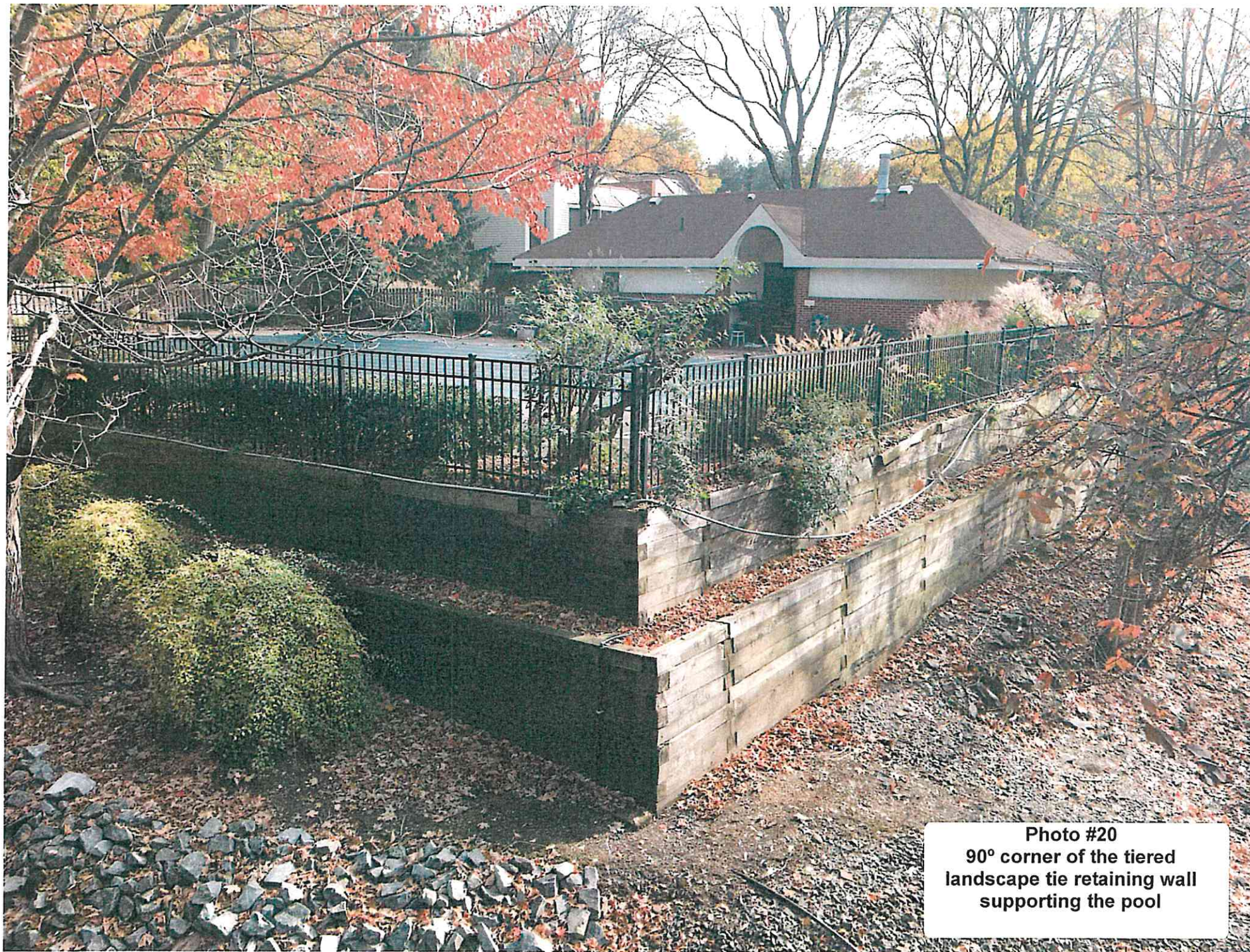
Photo #20 90° corner of the tiered landscape tie retaining wall supporting the pool