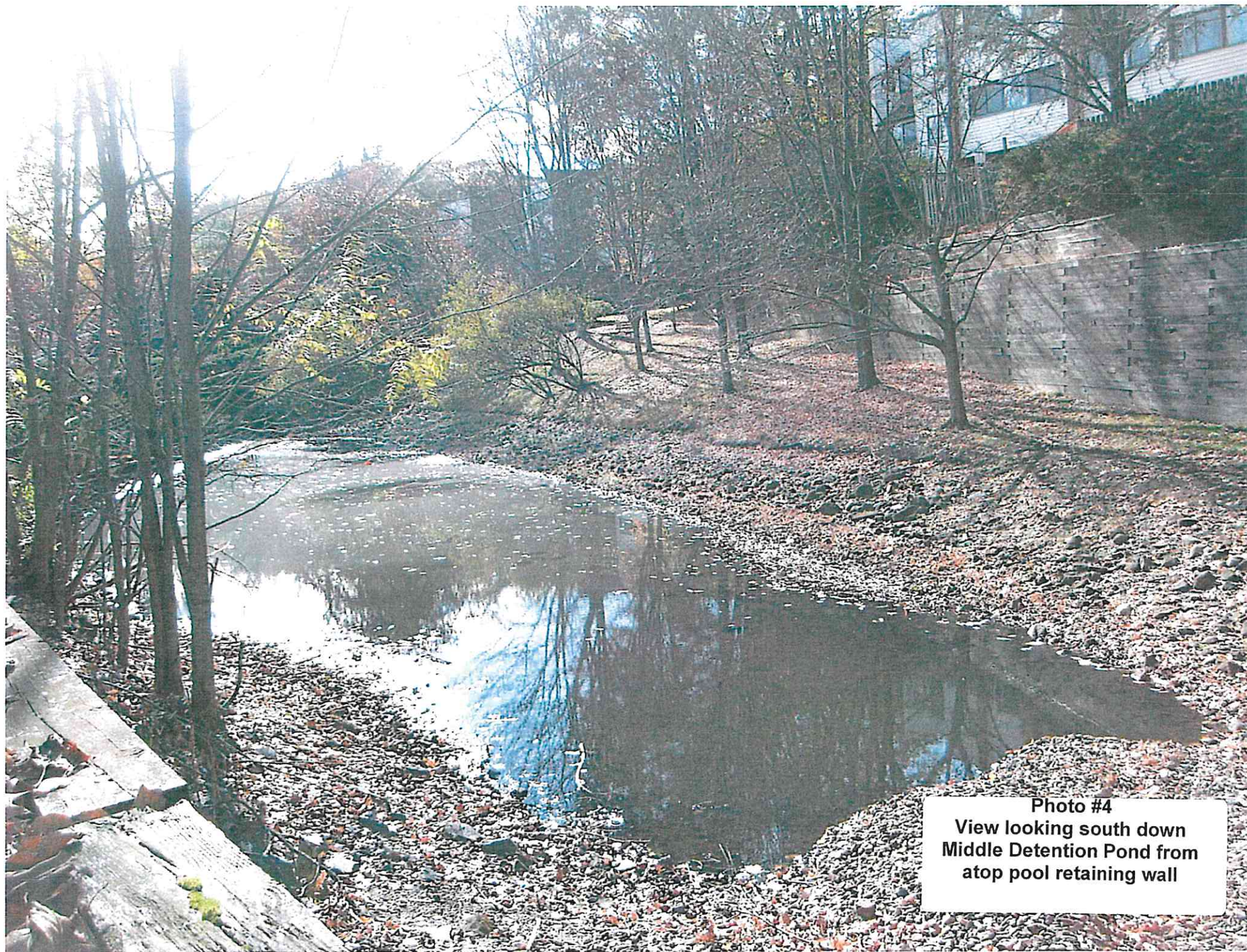
Photo #4 View looking south down Middle Detention Pond from atop pool retaining wall