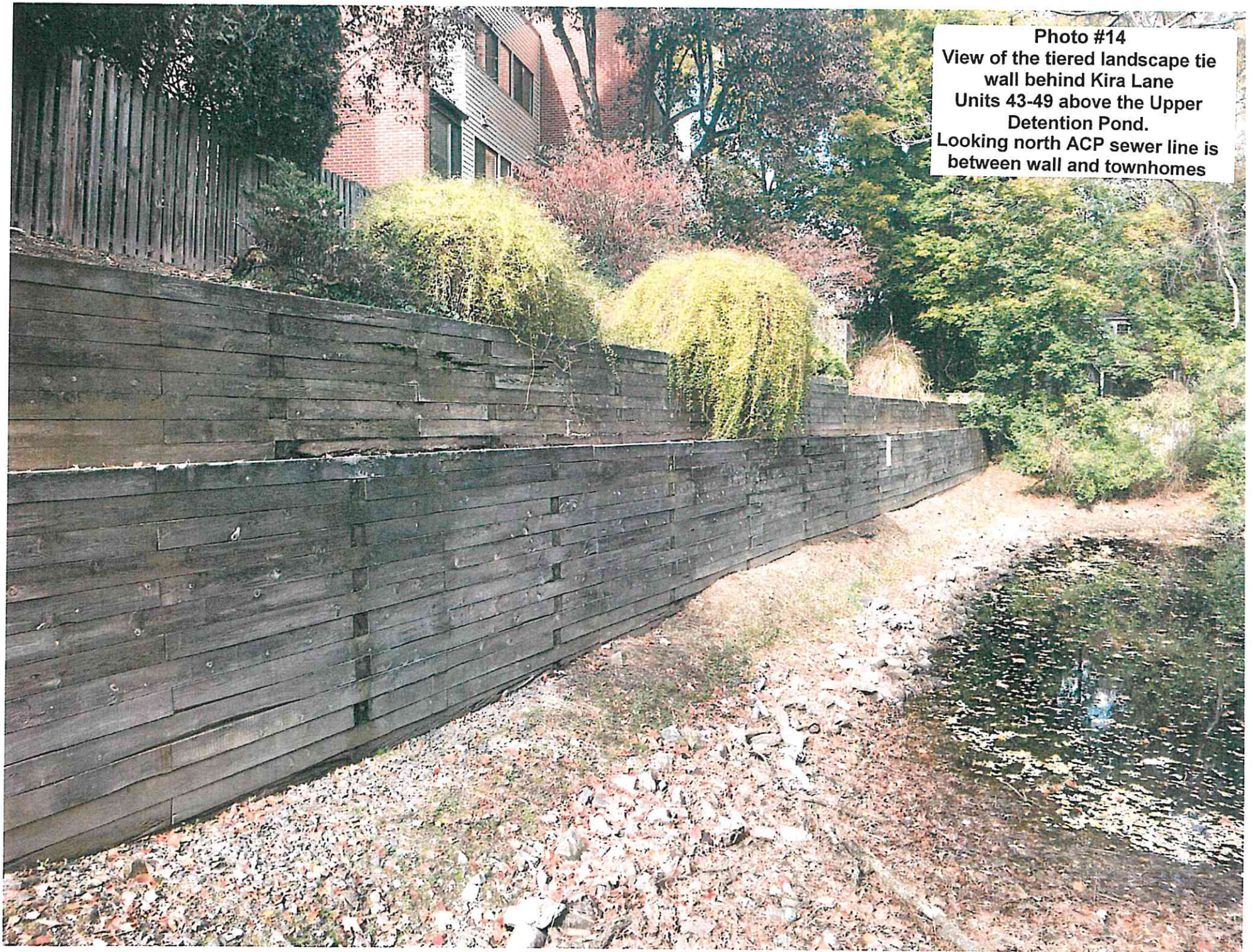
Photo #14 View of the tiered landscape tie wall behind Kira Lane Units 43-49 above the Upper Detention Pond. Looking north ACP sewer line is between wall and townhomes