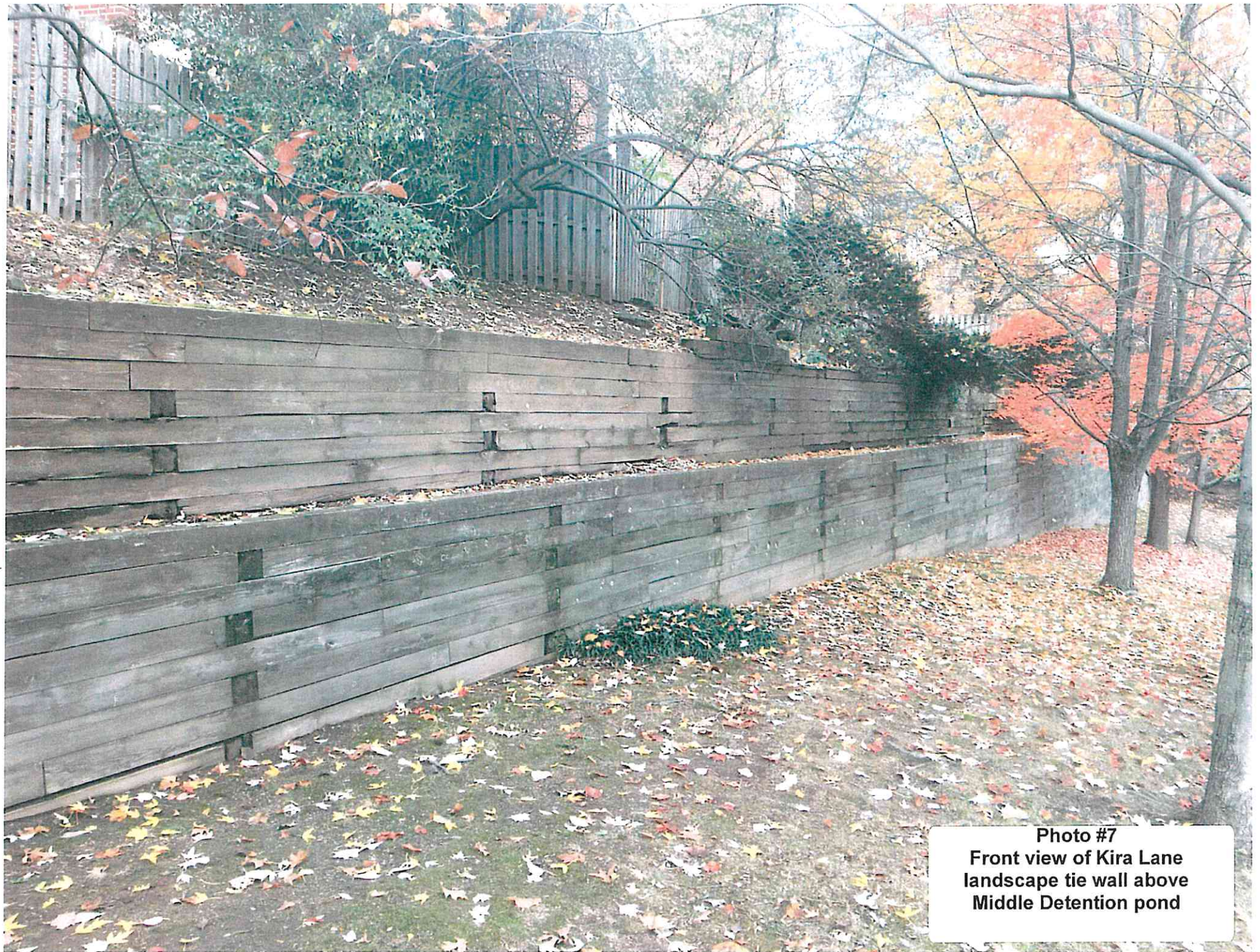
Photo #7 Front view of Kira Lane landscape tie wall above Middle Detention pond