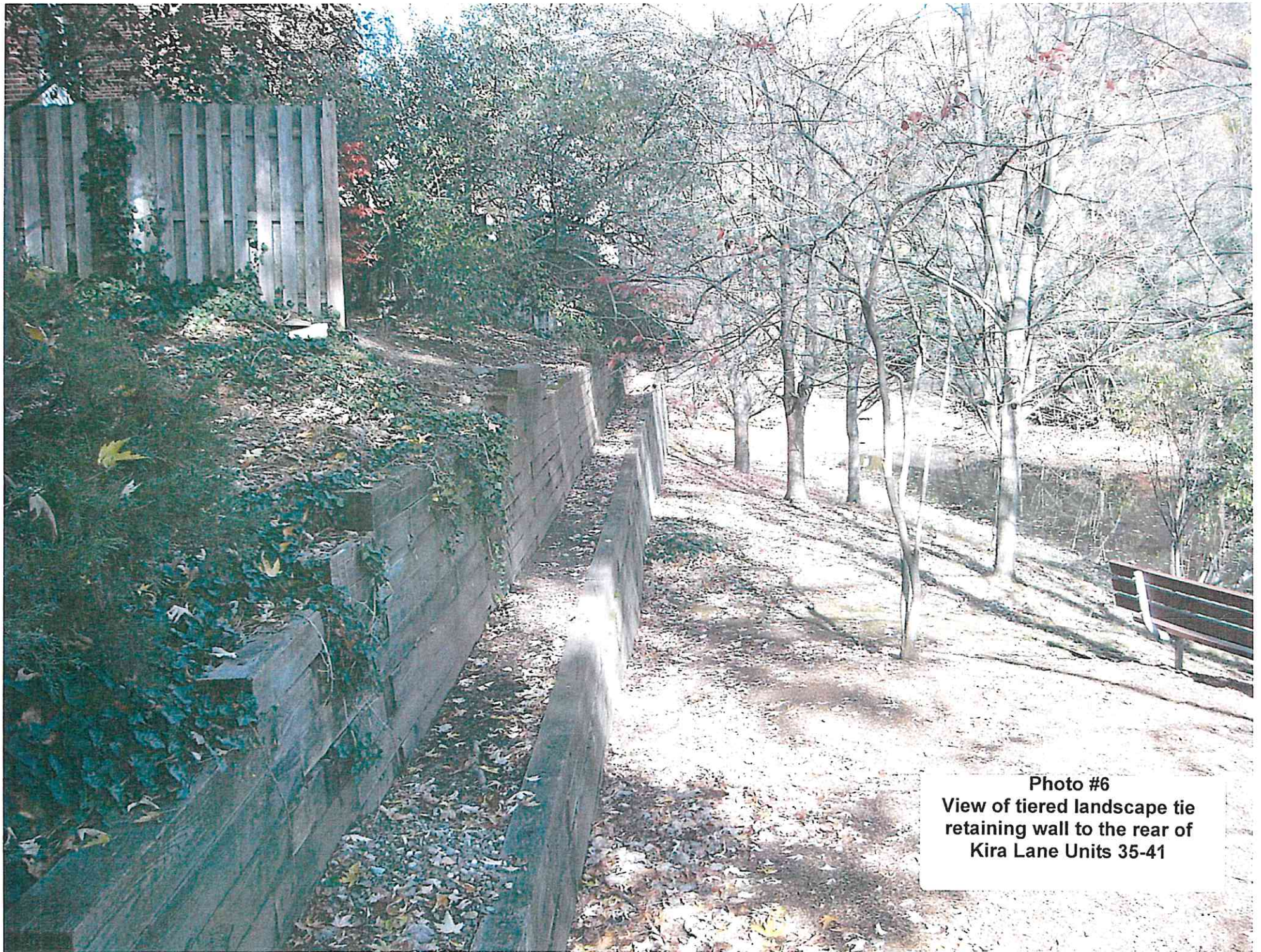
Photo #6 View of tiered landscape tie retaining wall to the rear of Kira Lane Units 35-41