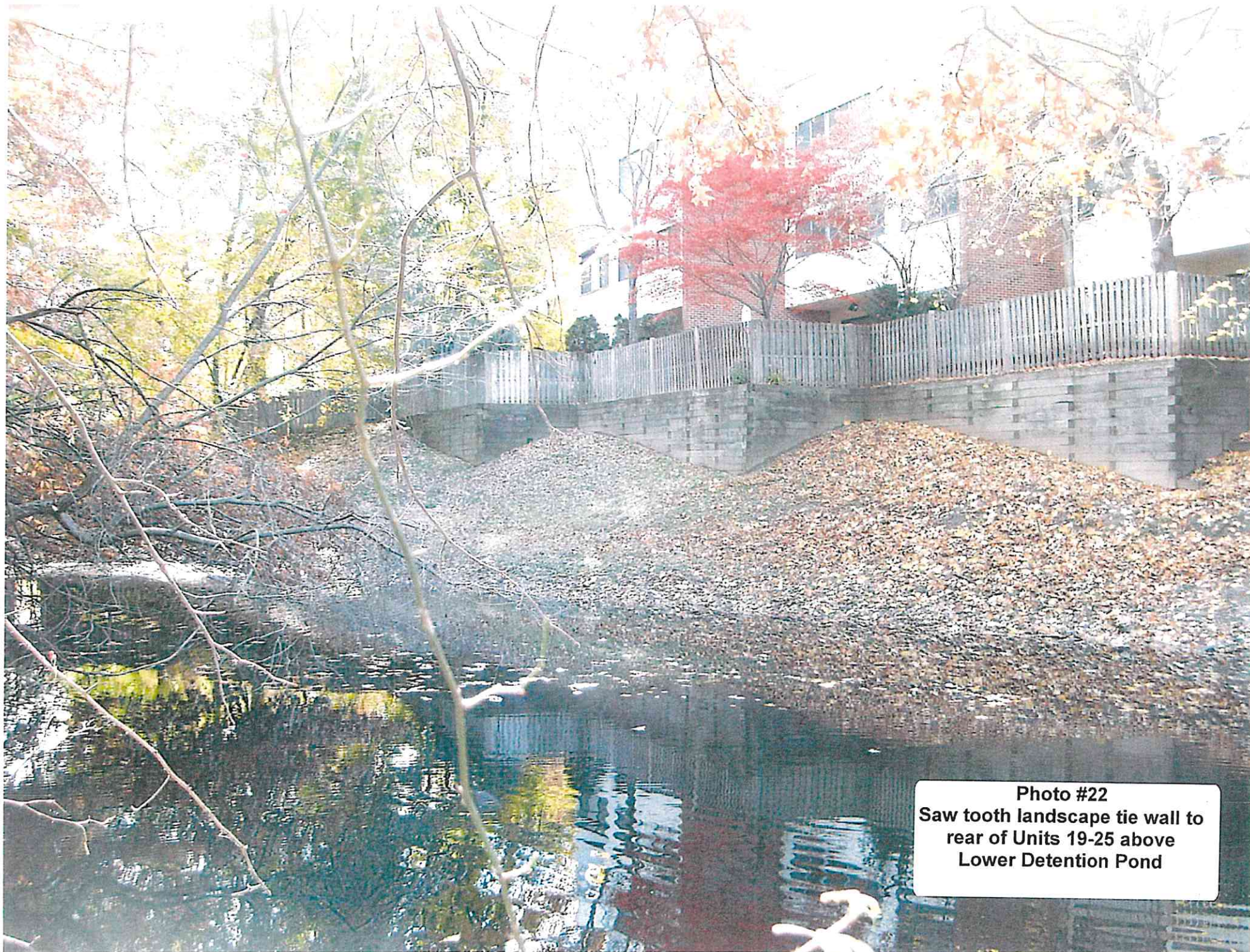
Photo #22 Saw tooth landscape tie wall to rear of Units 19-25 above Lower Detention Pond