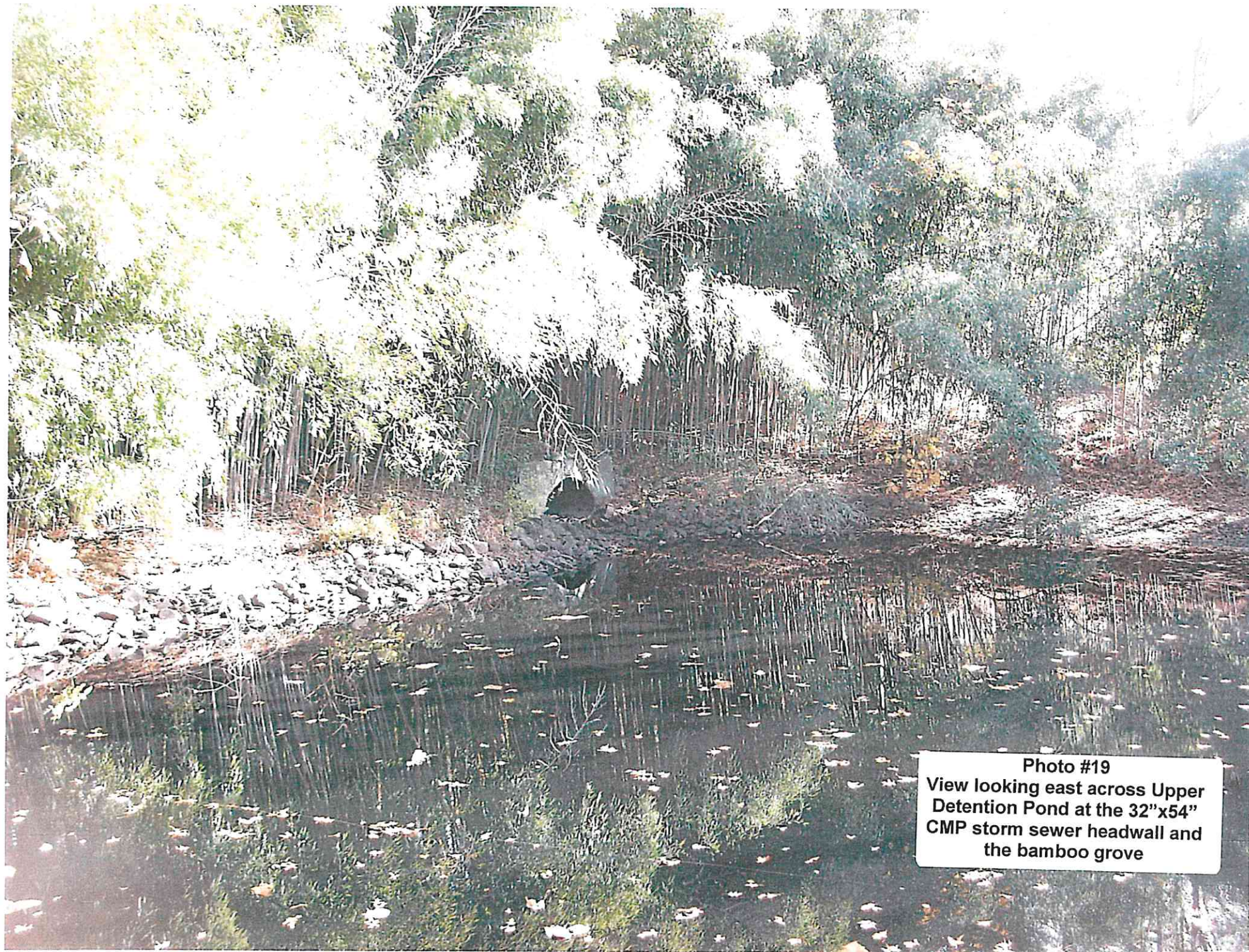
Photo #19 View looking east across Upper Detention Pond at the 32"x54" CMP storm sewer headwall and the bamboo grove