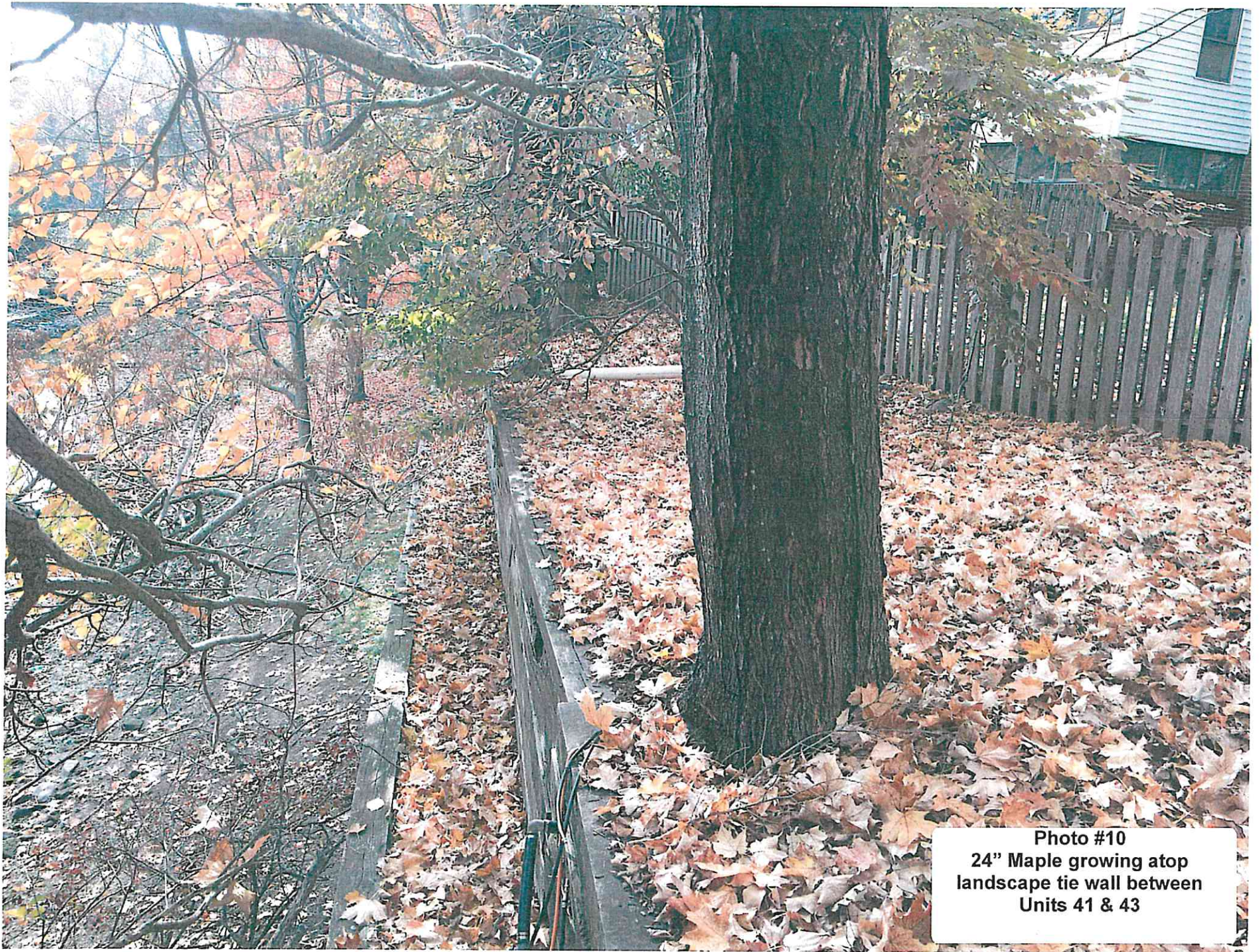
Photo #10 24" Maple growing atop landscape tie wall between Units 41 & 43