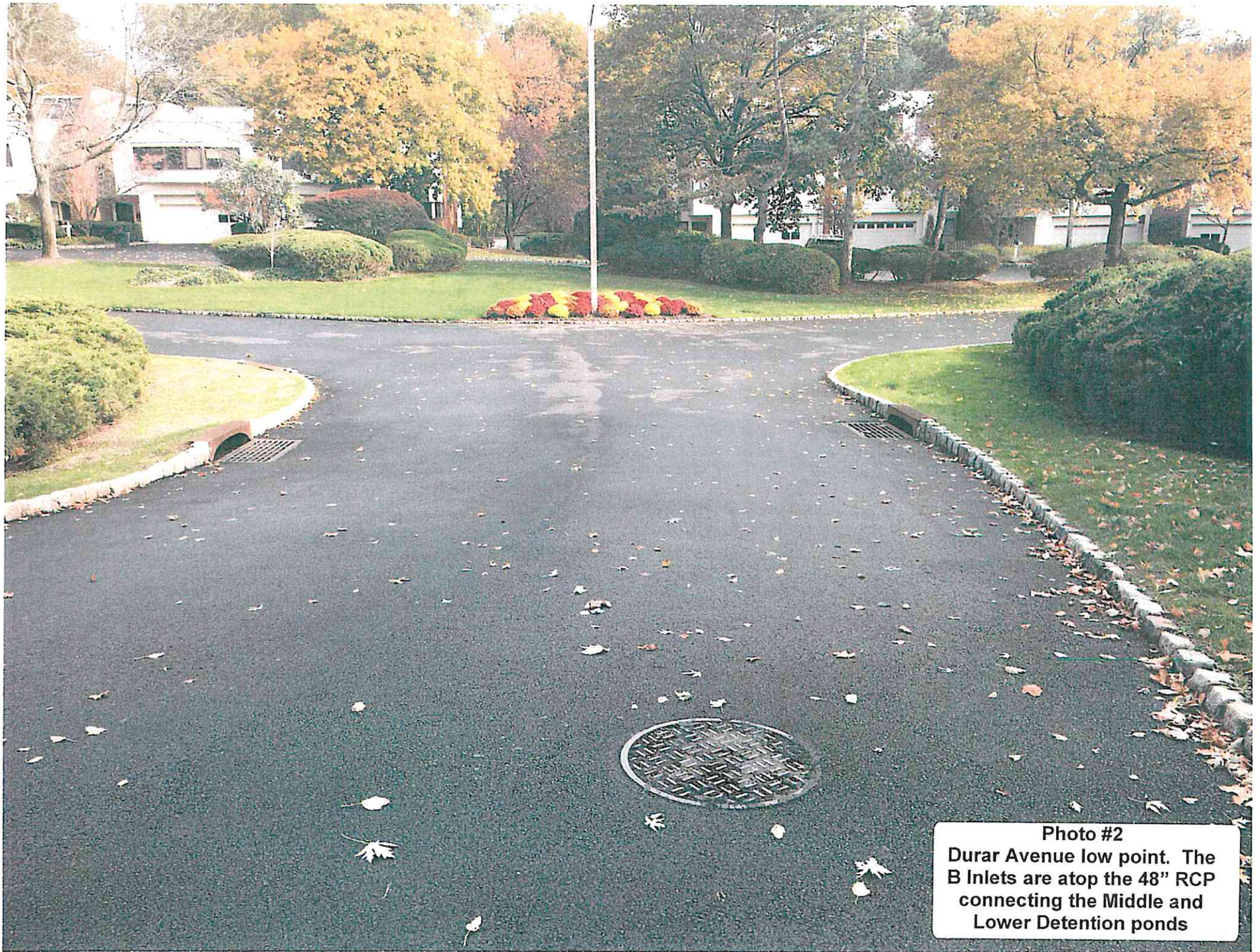
Photo #2 Durar Avenue low point. The B Inlets are atop the 48" RCP connecting the Middle and Lower Detention ponds