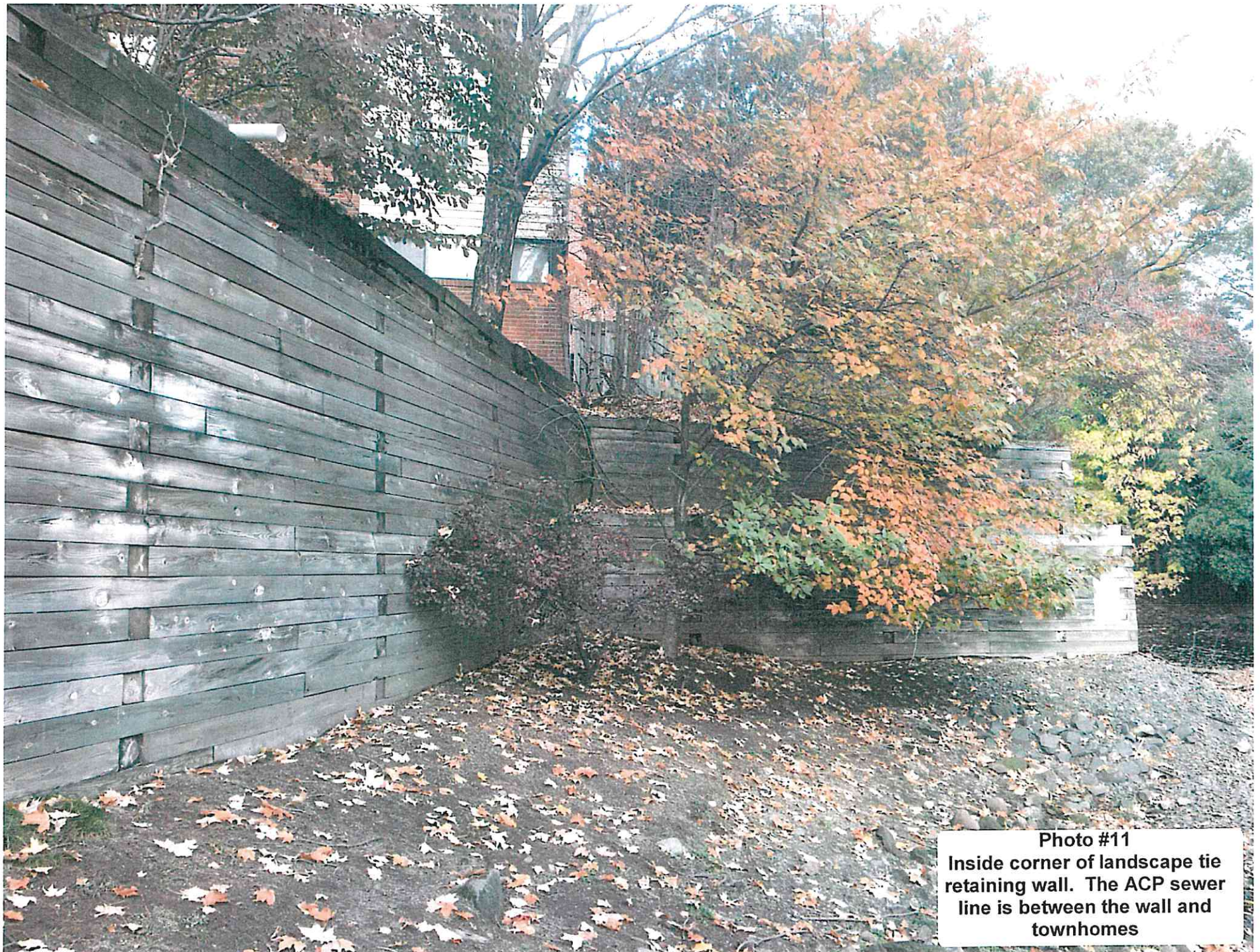
Photo #11 Inside corner of landscape tie retaining wall. The ACP sewer line is between the wall and townhomes